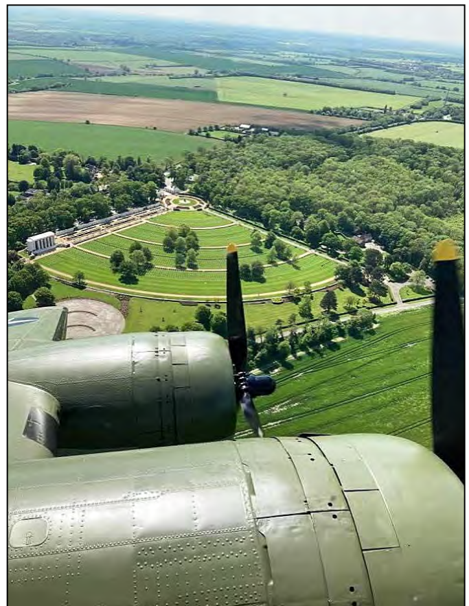
Cambridge American Cemetery as seen from the Sally B. Memorial Day, 2022.